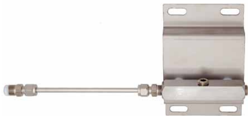
High pressure connecting manifold

Description High pressure connecting manifolds are used when more than one cylinder or bundle must be connected to a panel. Inlet check valves and/or inlet shut-off valves can be fitted on the inlet side. The manifolds can be mounted either on the right or the left side of the panel.