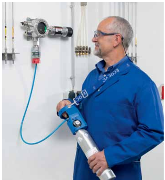
ECOCYL is portable, robust and easy to use - ideal for regular calibration procedures.