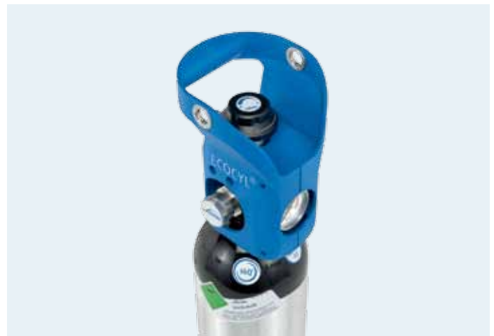
The non-removable cowling protects the valve and improves handling.

Devices like ECOCYL are also known as VIPRs, which stands for Valve with Integrated Pressure Regulator. The ECOCYL VIPR is always protected by a non-removable cowling that ensures safe storage, handling and use. This is especially important for portable packages, which are often used in remote areas and in rugged on-site settings. ECOCYL is tested and approved according to the applicable regulatory requirements for transportable pressure equipment.