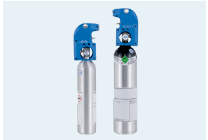
ECOCYL 201 and ECOCYL 202 packages.

Targeted at portable applications, the previous one-litre, 150-bar ECOCYL package has enjoyed considerable market success for several years. The product range has now been expanded to include the ECOCYL 201 and ECOCYL 202 packages. Available in one- and two-litre sizes, these upgraded devices work at filling pressures of up to 200 bar, offering more flexibility and up to 160% more gas content than the previous ECOCYL version. For even greater connectivity, ECOCYL comes with a standard barb outlet, a quick connector outlet or a ¼-inch compression fitting.