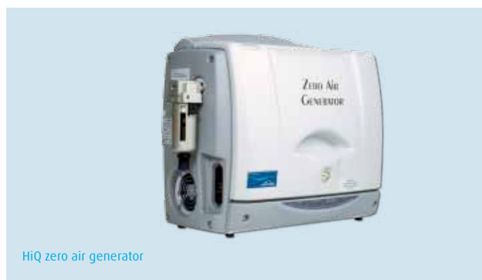
HiQ zero air generator

HiQ zero air and HiQ ultra zero air generator models utilise a multi-stage process to purify ambient air into high-purity analytical-grade air. All main components are manufactured with high-grade stainless steel and carefully installed in cabinets for easy of access and service.