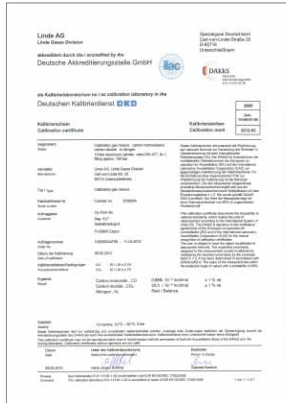
DAKKS calibration certificate

Our accreditations include calibration for binary and multicomponent mixtures, as well as calibration gases for emissions testing, calorific value measuring instruments and process gas chromatographs. These mixtures are preferably filled into 10 and 40 litre aluminium cylinders.