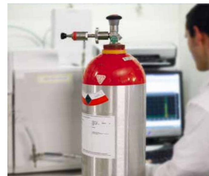
HiQ® gas mixture for Gas Chromatograph (GC) calibration