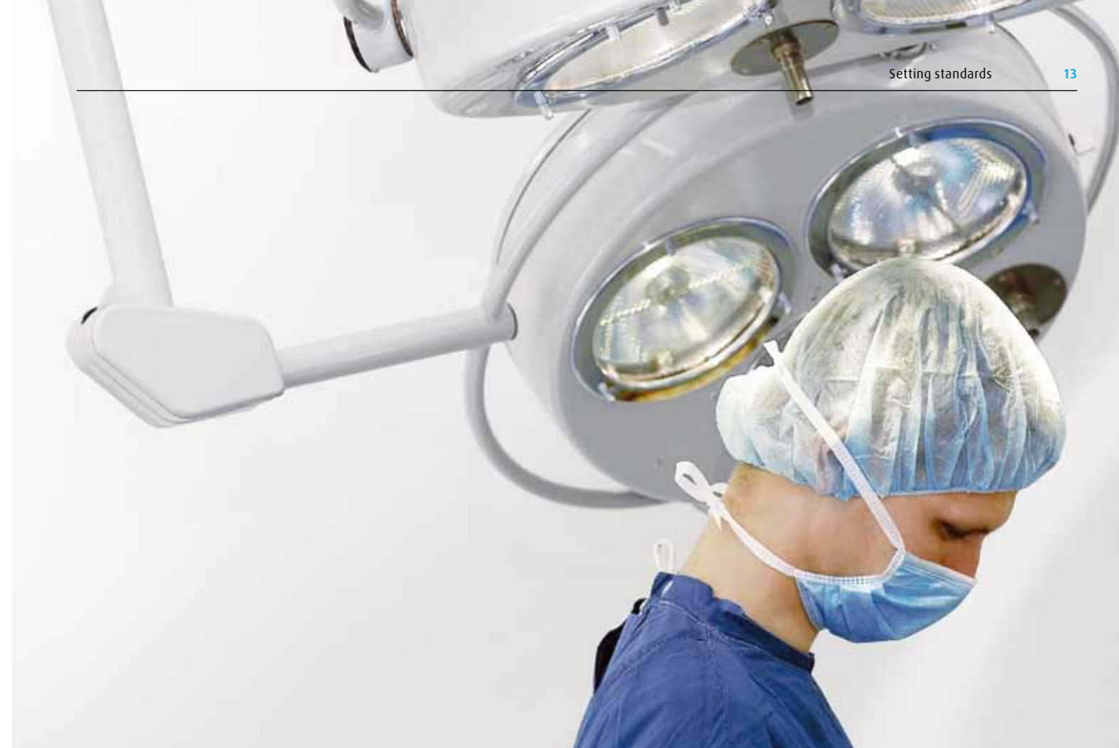
Xenon lighting for theatre surgery

Linde is also ISO 9001:2000 certified, demonstrating that our quality control procedures are regularly subjected to independent scrutiny and that we are committed to continuous improvement, based on the evolving needs of our customers and their feedback. Linde has had more than 250 facilities worldwide certified since 1988.