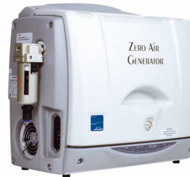
HiQ Zero Air Generator

Linde can help. We offer an unrivalled range of gas control equipment, including cylinder mounted gas regulators, gas control panels and point of use units.