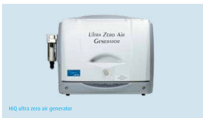
HiQ ultra zero air generator