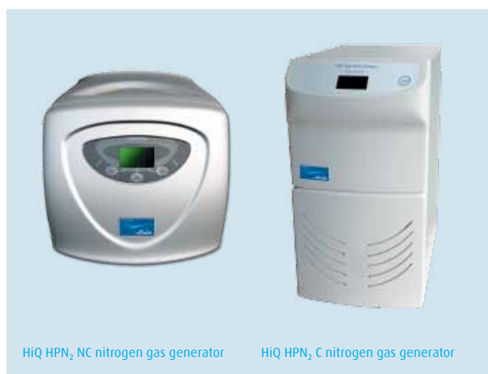
HiQ HPN 2 NC nitrogen gas generator

The C model includes an internal oil-free air compressor and the NC model requires an external source of compressed air.