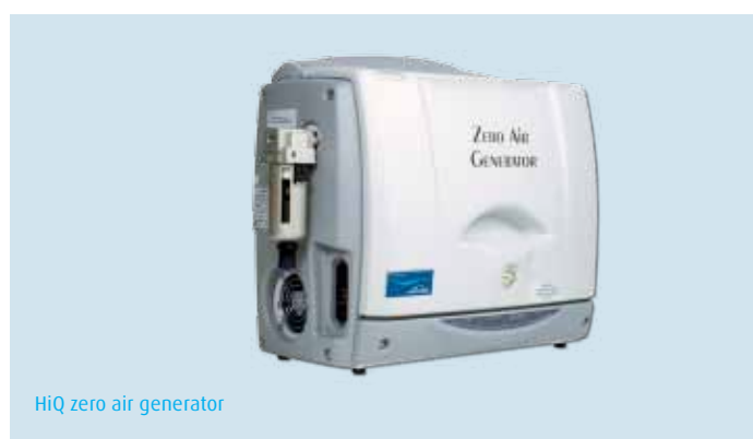
HiQ zero air generator

HiQ zero air and HiQ ultra zero air generator models utilise a multi-stage process to purify ambient air into high-purity analytical-grade air. All main components are manufactured with high-grade stainless steel and carefully installed in cabinets for easy of access and service.