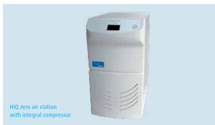
HiQ zero air station with integral compressor