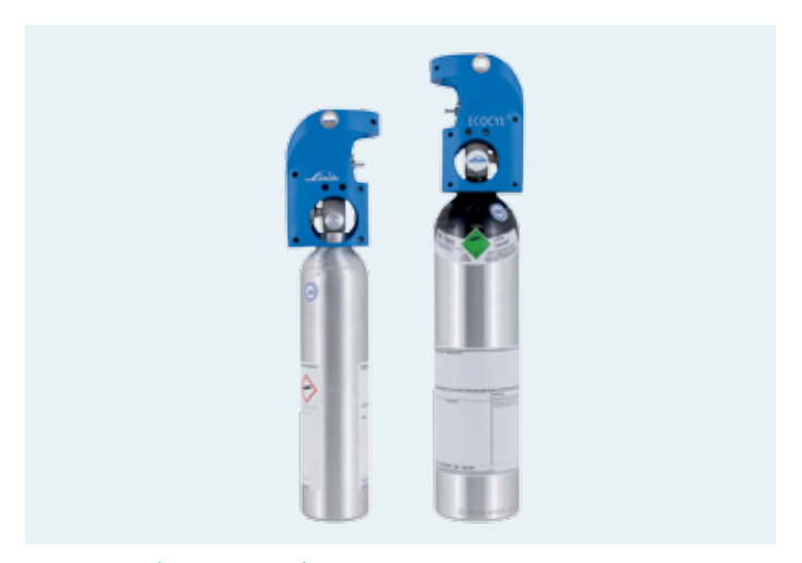
ECOCYL 201 and ECOCYL 202 packages.

Targeted at portable applications, the previous one-litre, 150-bar ECOCYL package has enjoyed considerable market success for several years. The product range has now been expanded to include the ECOCYL 201 and ECOCYL 202 packages. Available in one- and two-litre sizes, these upgraded devices work at filling pressures of up to 200 bar, offering more flexibility and up to 160% more gas content than the previous ECOCYL version. For even greater connectivity, ECOCYL comes with a standard barb outlet, a quick connector outlet or a ¼-inch compression fitting.