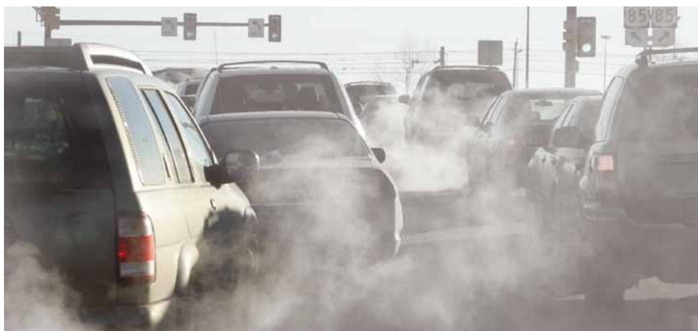
Car exhaust emissions

Precision matters... across industries & markets. Linde works with many leading corporations, manufacturers, research organisations, government agencies and small niche specialists, providing outstanding gas products for the widest range of applications.