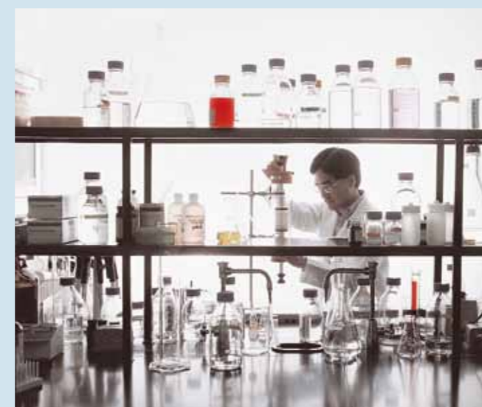
Research and testing

Linde produces and stocks a wide variety of pure gases and gas mixtures used across a variety of market sectors. These include lighting mixtures, automotive test gases, food packaging mixtures, laser mixtures (premix and pure gas), welding mixtures, refrigeration and sterilisation gases.