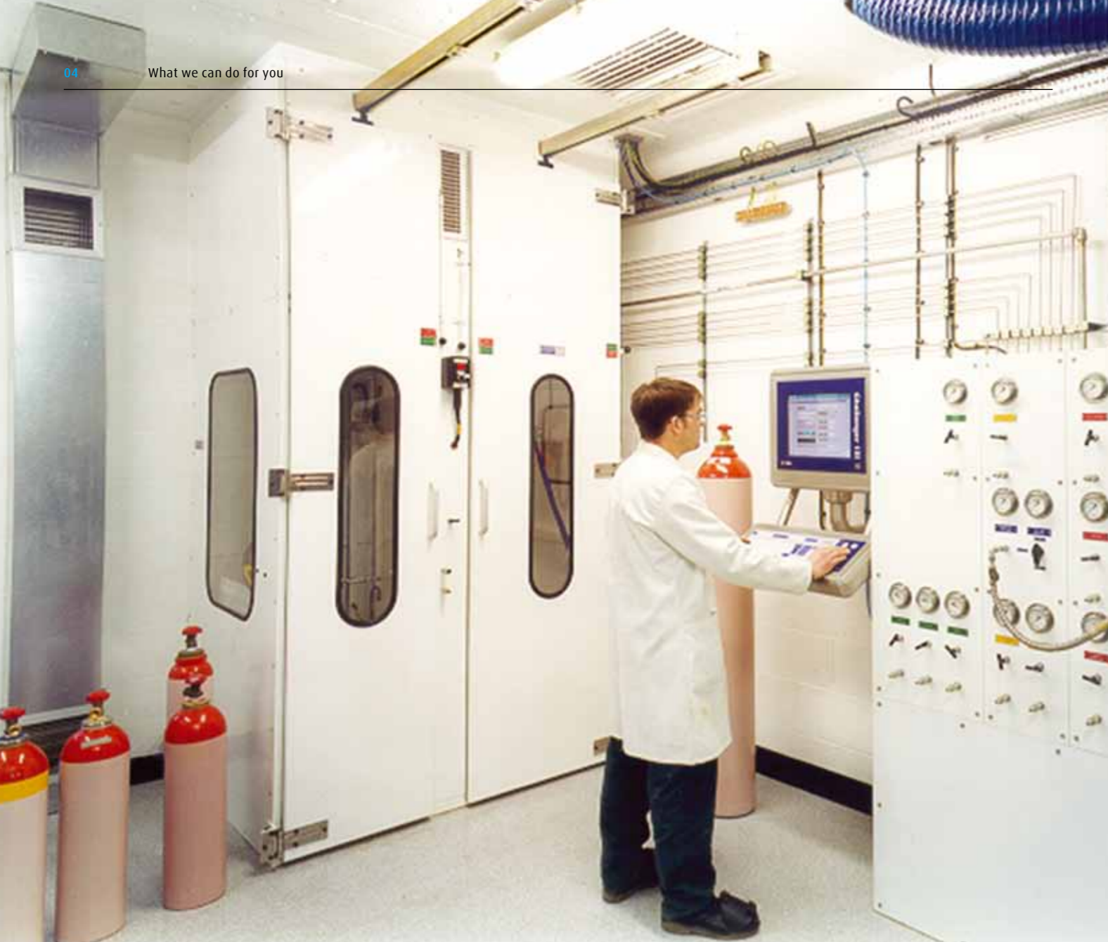
HiQ® high precision filling

Precision matters... in what we can do for you. As part of a global business with more than a century of experience, Linde is a leading supplier of specialty gases and specialty equipment in every corner of the globe. We've achieved this position by being totally dedicated to meeting our customer's needs with maximum precision.