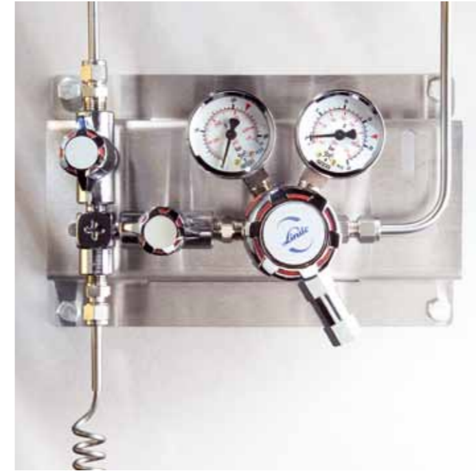
S201 Gas Supply Panel

Precision matters... in our gas equipment. When using specialty gases for analysis and high-tech production, it's essential to maintain the integrity of the gas between cylinder and instrument or reactor. The quality of your gas supply is only as good as the quality of your gas distribution system. Therefore, it is very important to design and plan the gas supply system carefully.