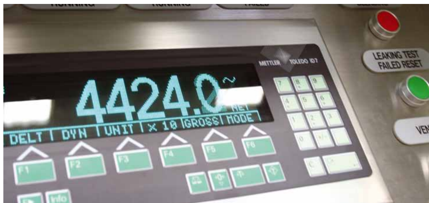
Precision filling starts with cylinder preparation

Precision matters... in accuracies & tolerances. With HiQ®, your specialty gases products are highly accurate, repeatable, stable, certified, and accredited. Using industry-leading measurement techniques, we provide gases with accuracies and tolerances to suit your needs. This leads to greater efficiency for you, enhancing your profitability.