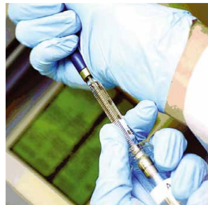
Taking a liquid sample for analysis