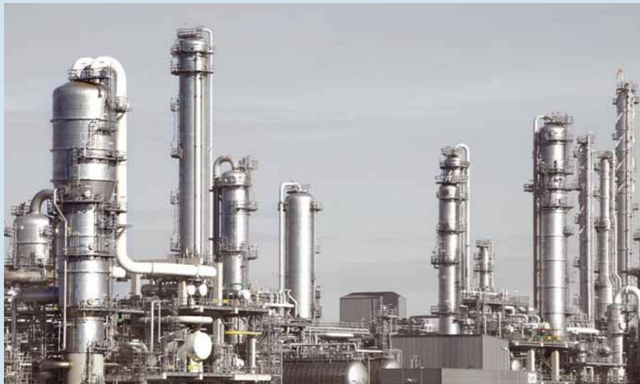
Petrochemical refinery complex

Our industry is highly complex. But our vision is simple.