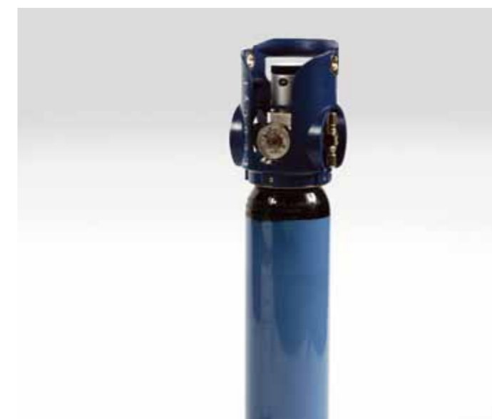
ECOCYL™, Portable gas solutions

With Linde, you can trust a global leader to provide world-class products to the highest standards, across every business sector on time and to your specification.