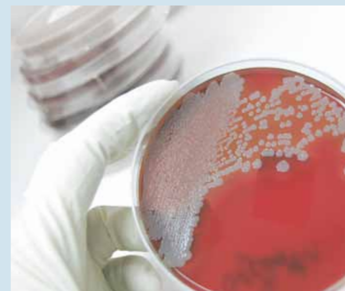
Anaerobic culture growth

With pharmaceutical and biotech production, suppliers must perform to stringent standards of product quality and control. In addition to HiQ® specialty gases, Linde has a complete line of VERISEQ® traceable pharmaceutical gases that are used in many areas, from an ingredient in the manufacture of APIs, Research & Development, and Quality Control.