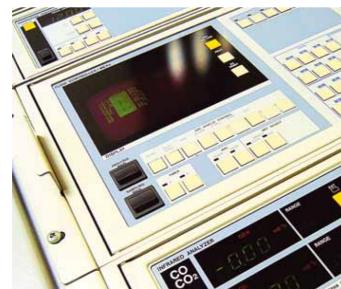
Infrared analysers used in Environmental monitoring