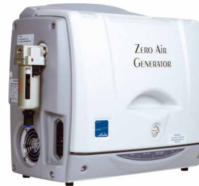
HiQ Zero Air Generator

Linde can help. We offer an unrivalled range of gas control equipment, including cylinder mounted gas regulators, gas control panels and point of use units.