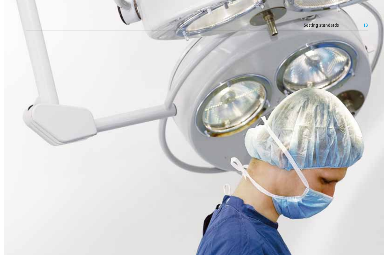
Xenon lighting for theatre surgery

Linde is also ISO 9001:2000 certified, demonstrating that our quality control procedures are regularly subjected to independent scrutiny and that we are committed to continuous improvement, based on the evolving needs of our customers and their feedback. Linde has had more than 250 facilities worldwide certified since 1988.